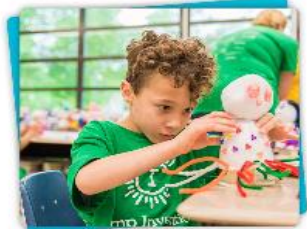
A 1st grader uses creative problem solving to turn a robot into a stufie with style.