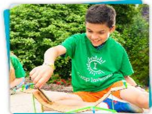
A 7th grader practices trials — and persistence — with the mini skate park they designed.