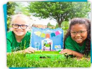
7th graders build collaboration skills as they create their very own pop-up business.