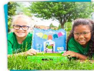
7th graders build collaboration skills as they create their very own pop-up business.