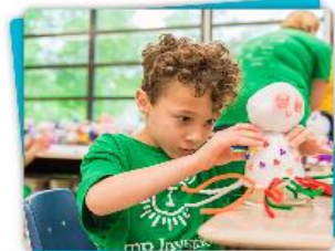
A 1st grader uses creative problem solving to turn a robot into a stufie with style.