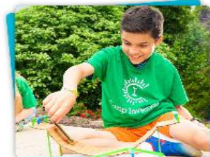
A 7th grader practices trials — and persistence — with the mini skate park they designed.