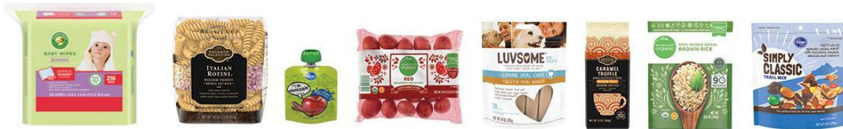
All Kroger packaging; Simple Truth, Private Selection, Kroger, Comforts, Hemis Fares, Luvsome, Abound and other Kroger Co brand flexible plastic packaging.