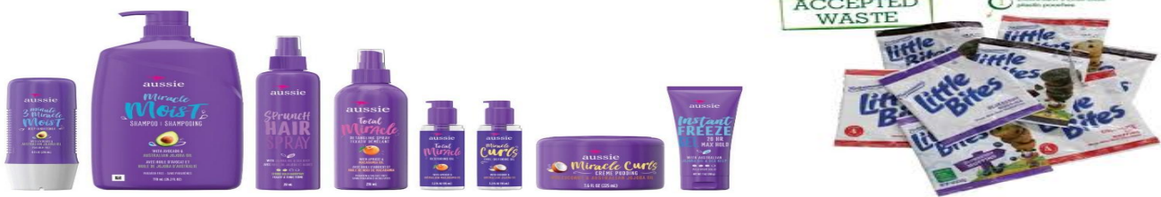
Only Aussie brand bottles.