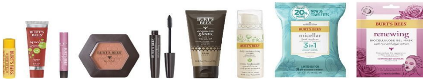
All Burt's Bees products.