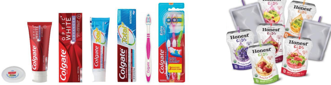
All oral care product brands and packaging they came in. Any aluminum and plastic drink pouches.