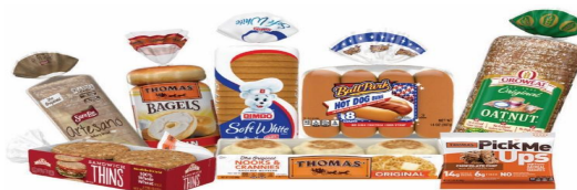
Ball Park, Boboli.

All Bimbo USA bread, buns, Brands include Thomas,